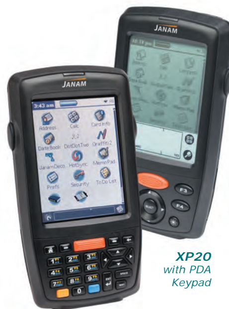
XP30 with Numeric Keypad

The XP30 is the world's first fully-featured mobile computer that scans barcodes and runs the latest version of the Palm OS. A brilliant, color, quarter-VGA display and blazing Freescale™ architecture make the XP30 a best-of-breed, rugged, barcode scanning, mobile computer, while its list price makes it impossible to ignore. For customers who want to extend the reach and capability of their mobile Palm applications, the XP30 has the horsepower to execute mission-critical data collection tasks at the point of business activity. And for customers who are ready to switch to the Palm OS for its simplicity and its durability, the XP30 is a platform that pays for itself twice as fast as comparable devices.